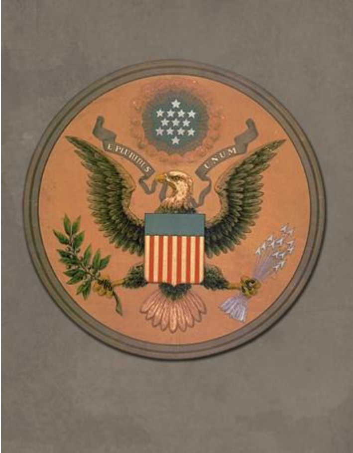
The Great Seal of the United States.

Did you know that you are carrying a history lesson in your pocket or purse? You will find it on any $1 bill. Look at a dollar and see for yourself.