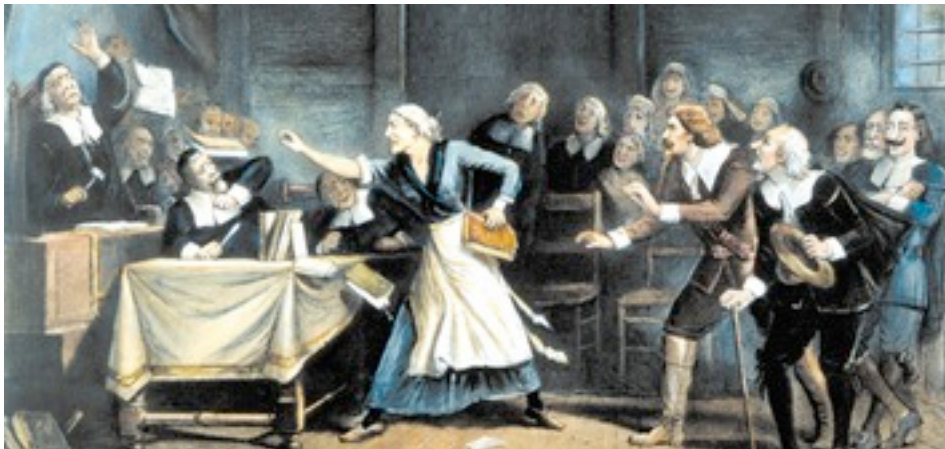
Click to read caption

Lesser crimes, such as drunkenness and breaking the Sabbath (working or traveling on Sunday), were punished with fines, short jail terms, or public humiliation. A colonist caught breaking the Sabbath, for example, might be locked in the town stocks. The stocks were a heavy wooden frame with holes for a person's neck, wrists, and ankles. Lawbreakers were locked for hours in this device in a public place where others could ridicule them.